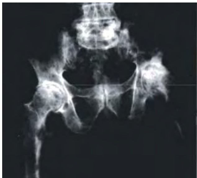
FIG. 1 A

The patient received a definitive diagnosis of synchronous multiple primary neoplasms, associating a K light chain multiple myeloma in Durie-Salmon