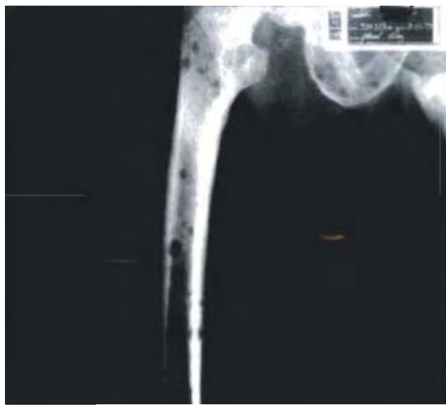
FIG. 1 B